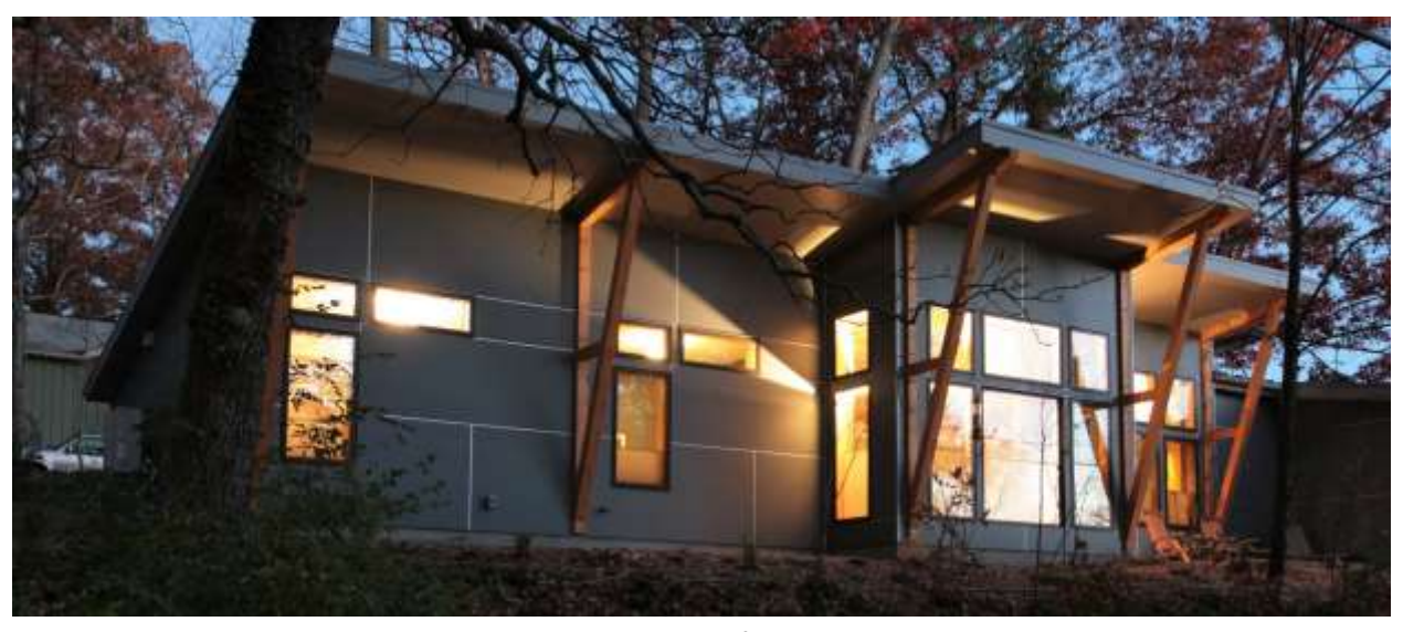
Figure 6: Unity Homes finished product