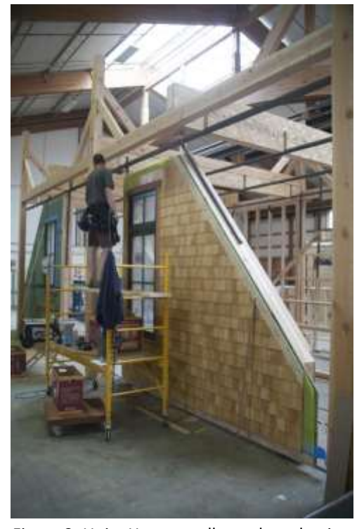
Figure 3: Unity Homes wall panel production