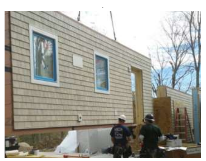
Figure 5: Unity Homes field assembly