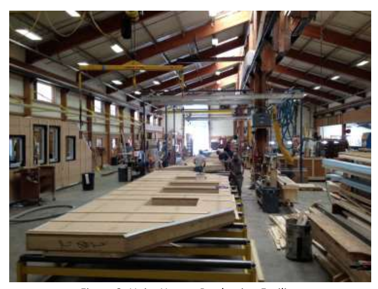
Figure 2: Unity Homes Production Facility.

As I continue to say in these articles, I am not associated with or financially linked to any product, technology, or manufacturer. I'm simply a long-time industry observer asking hard questions why so many compelling new technology solutions are so slow to be embraced when they offer so many solutions and benefits to the housing industry. Clearly Unity needs to achieve scale to realize optimum cost of production benefits. But from where I sit, this is another important opportunity for a long overdue framing platform change.