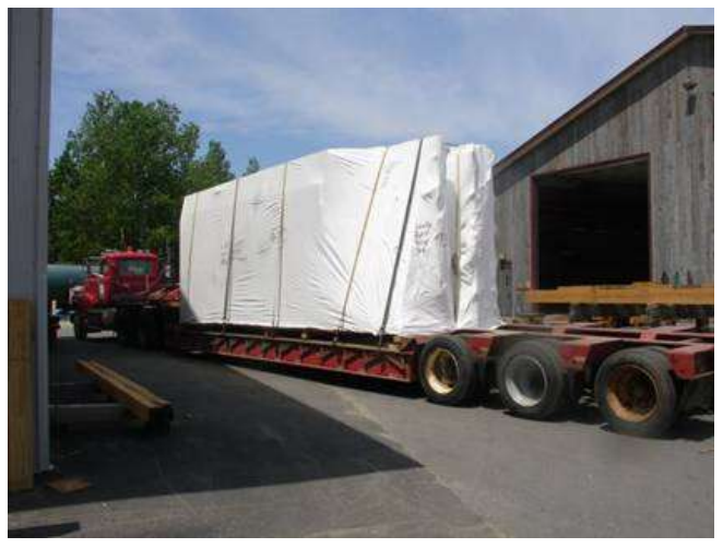
Figure 4: Unity Homes panels sequenced and loaded for shipping