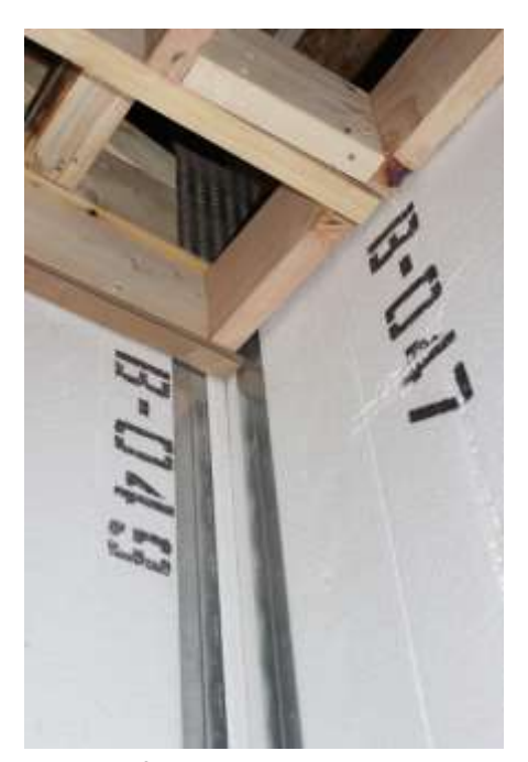
Figure 3: Numbered panels for easy assembly and raised heel construction