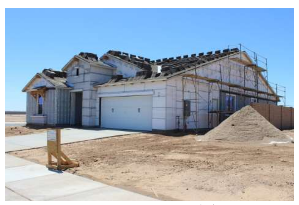
Figure 2: ICP walls assembled ready for finish