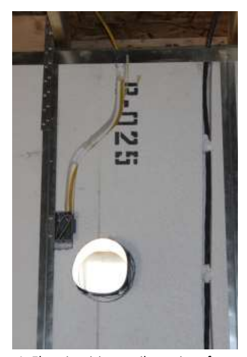
Figure 4: Electric wiring easily cut into foam panel

This article is part of a series on housing innovation based on the author's book, 'Retooling the U.S. Housing Industry: How It Got Here, Why It's Broken, and How to Fix It.' This book examines opportunities to transform the homebuyer experience relative to five key components: 1) Sustainable Development, 2) Good Design, 3) High-Performance, 4) Quality Construction, and 5) Effective Sales. Each article features one innovation or business principle covered in workshops with builder executives. Find out how to participate in one of these workshops at <a href="https://www.SamRashkin.com">www.SamRashkin.com</a>.