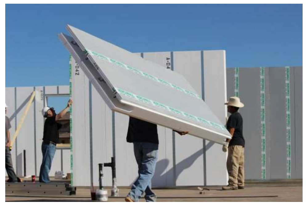
Figure 1: Lightweight panels easy to handle in the field